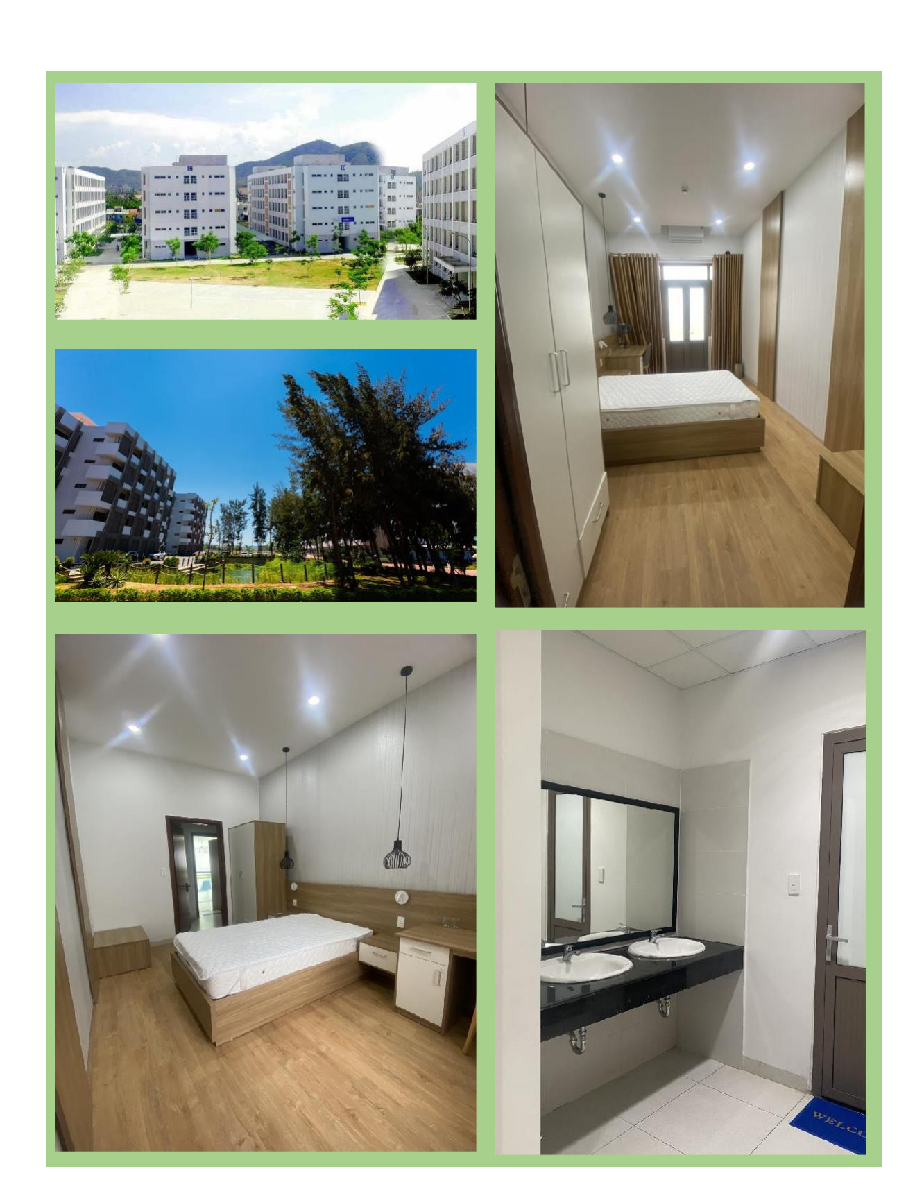
FPT University Danang Dormitory for employees