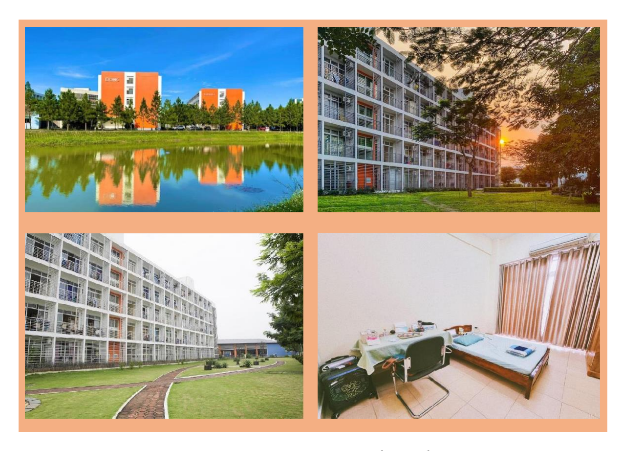
FPT University Hanoi Dormitory for employees