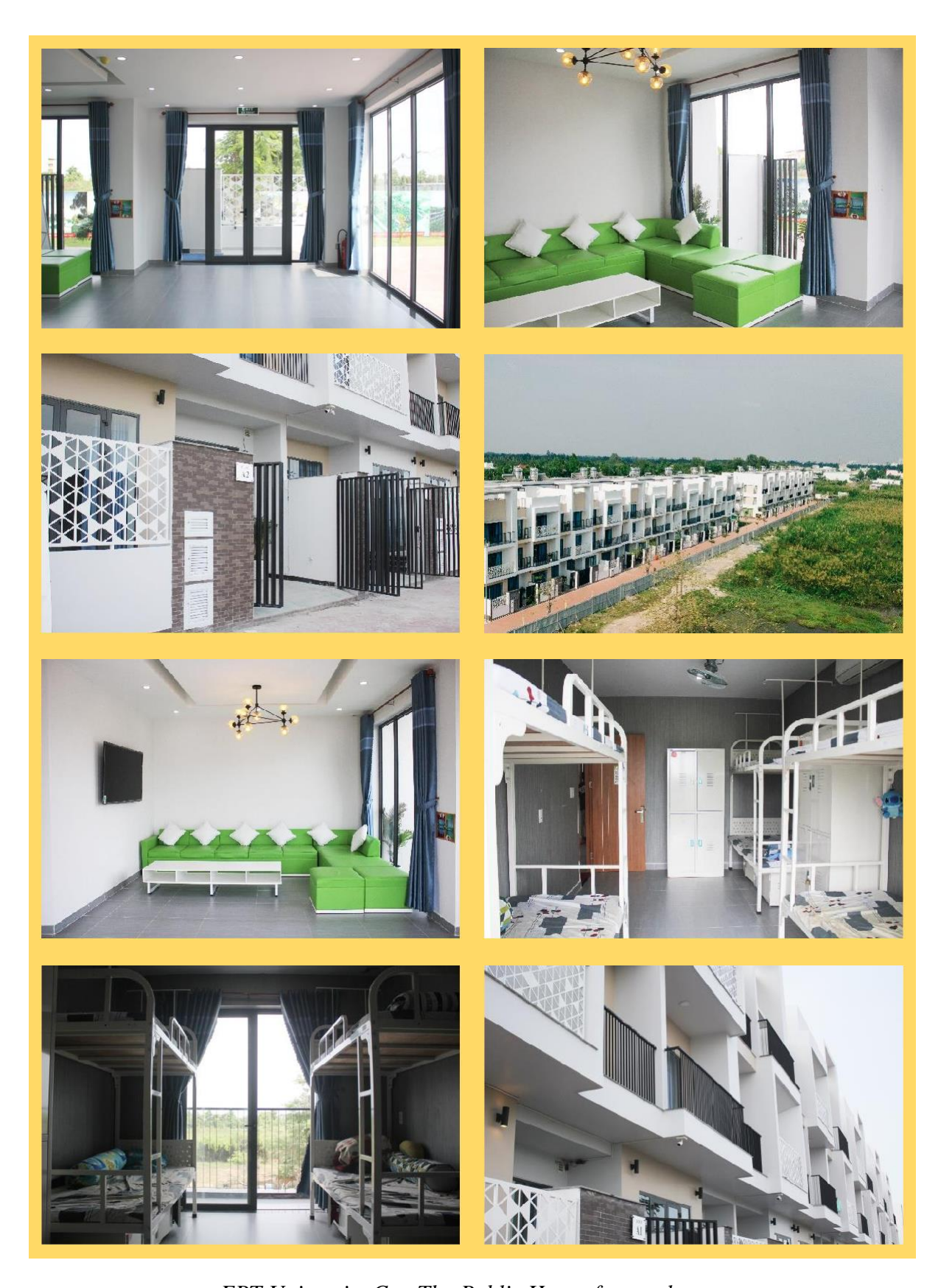
FPT University Can Tho Public House for employees