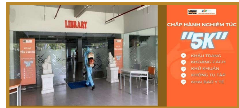
Hygiene rules "5K rule"