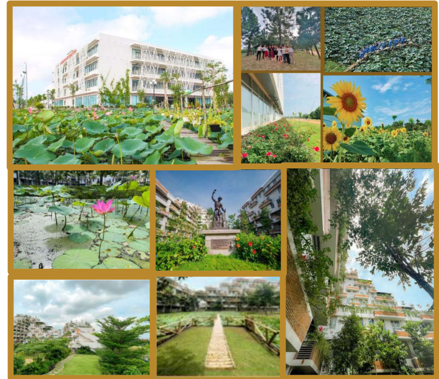
Plants and trees on the FPT University campuses