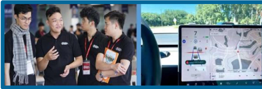
Four students from Capstone Project – Dima with their product called "Driver Behavior Monitoring Assistant"

This is AN APPLICATION to help manage city traffic and reduce traffic accidents, built and developed by FPT University students.