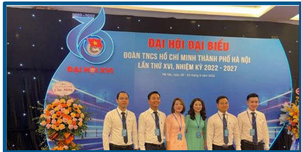
FPTU's youth delegates attended the Hanoi Youth Delegate Congress.

FPT University is a private school established in 2006. The model of private schools in Vietnam is quite new. The system of private schools, established in 1997, has contributed to training 253,000 students (accounting for 13.26 percent) to the national higher and college education system by 2019. FPT University is a school that ACTIVELY PARTICIPATES IN THE INSTITUTIONAL BUILDING FOR PRIVATE SCHOOLS , contributing a lot of ideas to building HIGHER EDUCATION LAWS AND DEVELOPMENT STRATEGIES FOR HIGHER EDUCATION IN VIETNAM through the National Council of Education Council and Human Resources and the Union of Universities and Colleges of Vietnam. Thereby, it has contributed to SUPPORTING THE HEALTHY AND FAIR DEVELOPMENT OF THE VIETNAMESE HIGHER EDUCATION SYSTEM .