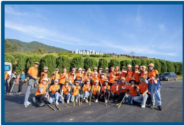
An activity organized by FPT's trade union every year for CBGV. : hiking

The UNION is the representative organization of all employees in the university. This organization is recognized by the university's leaders.