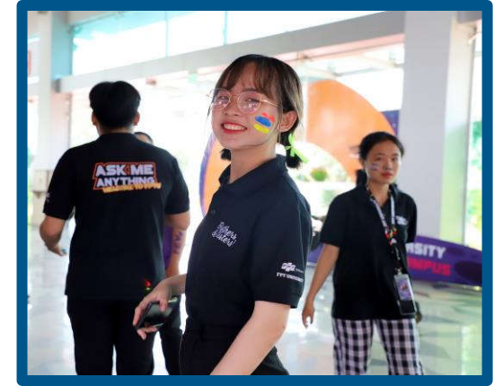
Student Clubs Festival

The core values that FPT University upholds are creativity, difference, confidence, dynamism, freedom in academics, in presenting all their opinions and developing students' critical thinking in education and all aspects of life.