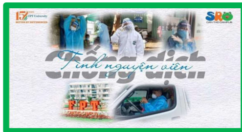
6 students are rewarded for their participation in COVID-19 frontline prevention work in Can Tho city