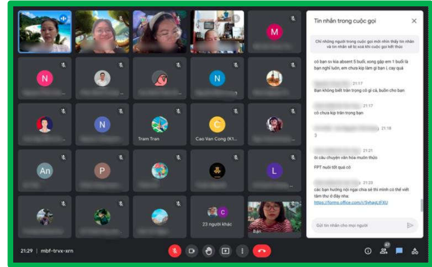
Live photo of Talk show "HSCAI?"

On average, 80-100 students from all over the country attend each topic, including high school students and other schools in Vietnam. They look forward to every 3rd Friday of the month to share their story.