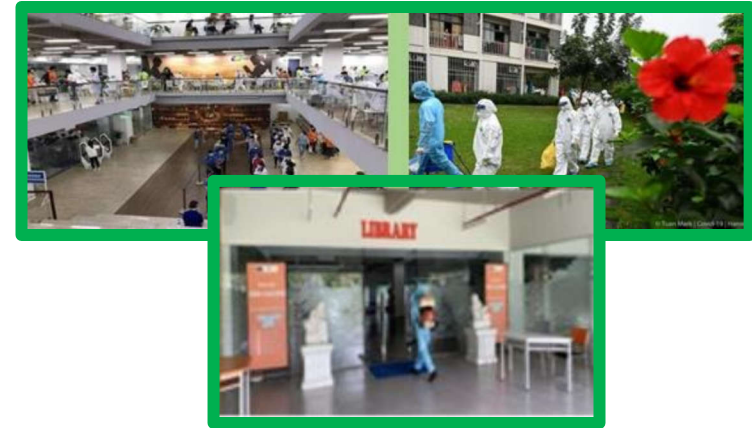
FPT University as the public vaccination site of District 9's High Tech Park, Ho Chi Minh City

The university has made initial TREATMENT RECOMMENDATIONS and provided the NECESSARY INFORMATION for the students and employees affected by COVID-19. The university has organized VACCINATION PROGRAMS for the majority of its employees, teachers, including foreign teachers while also encouraging and reminding everyone to be vaccinated as soon as possible. FPT University campuses in Hanoi had dedicated its 2,000-room dormitory to be A QUARANTINE SITE during the outbreak of the COVID-19 pandemic in 2019 and 2020, while the university students were studying online at home.