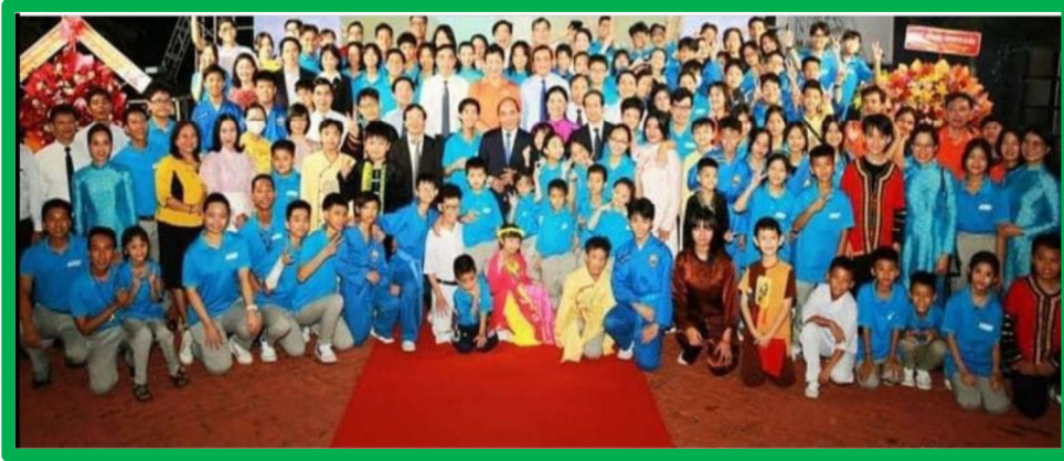
Hope School students with leaders, guests, sponsors, and teachers and staff.

Not only helping the Vietnamese community, but several FPT University staff and students have also JOINED CHARITIES AND NGOS TO DONATE MEDICAL SUPPLIES TO OTHER COUNTRIES who are suffering from the pandemic, including Italy, the Czech Republic, the United States, and India. These activities are organized by International Centre for Theoretical Physics (ICTP) graduates (Triest, Italy), The Vietnam – US Alumni Club, along with a few other supportive activities that we have not had the complete list of.