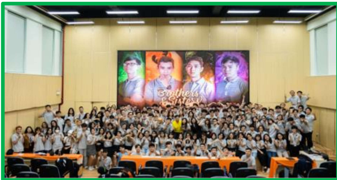
Selection session for members and mentors of Bro-Sis program