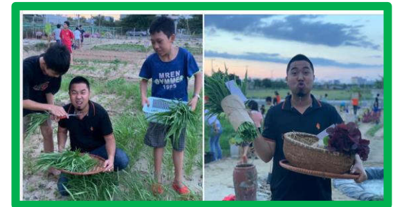
And today, the smile has returned to children. Children and the vegetable beds grown by themselves.

The fourth outbreak in Vietnam caused severe consequences, especially in Ho Chi Minh City. More than 30,000 people died. Even more painful, thousands of children lost their parents. In September 2021, FPT President decided to open a school to receive orphans because of the pandemic. In August 2022, the Hope School for orphans of FPT welcomed the first 200 students. The children are raised completely free of charge until they start a business. FPT School and FPTU are schools for children of all ages.