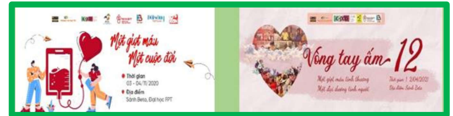
An annual blood donation program 'Warm hands' (Vong tay am)

In August 2021, the dormitory of FPT University Da Nang DONATED AROUND 202 ROOMS, TOTALING 800 BEDS, WITH FULL ELECTRICITY, WATER, AND SERVICES FOR COVID-19 PATIENTS.