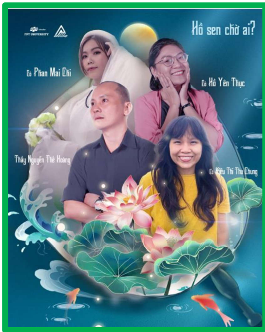
Speakers "Hồ sen chờ ai?"

But the real need for school psychology care today is really great. Stemming from love and responsibility during the pandemic with their students, a group of FPTU lecturers opened a topic: "Hồ Sen Chờ Ai" (HSCAI) as a place for students to share and remove their concerns, worries, needs to be answered and even deadlocks in their private lives.