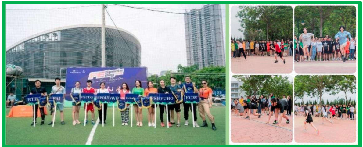
FPT University on sporting day

FPT University's SPORTING EVENTS, CONTESTS, AND ANNUAL SPORTING DAY have all been disrupted over the pandemic, but we continue our attempts in keeping them going as much as possible.