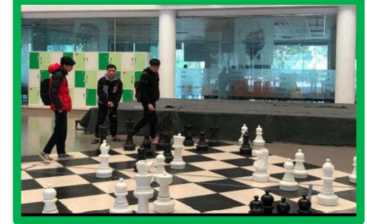
A chess zone in FPT University

FPT University's campuses reserve much SPACE FOR SPORTS ACTIVITIES OF STUDENTS AND THE COMMUNITY.