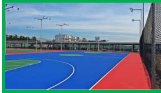
FPTU Can Tho basketball court

orphans due to the Covid pandemic from 41 provinces were received by HOPE School during the school year.