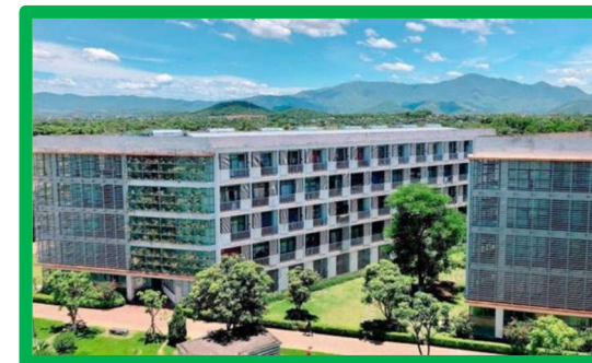
FPT University Dormitory is utilized as a quarantine site until COVID-19 is over

During the pandemic in Ho Chi Minh City and Can Tho City, many of the university's staff and students volunteered to JOIN THE "COVID-19 FRONTLINE PREVENTION TEAM" , providing food and medicine to medical staff, patients, and families, as well as disadvantaged children in hospitals and blockage and rural residential areas.