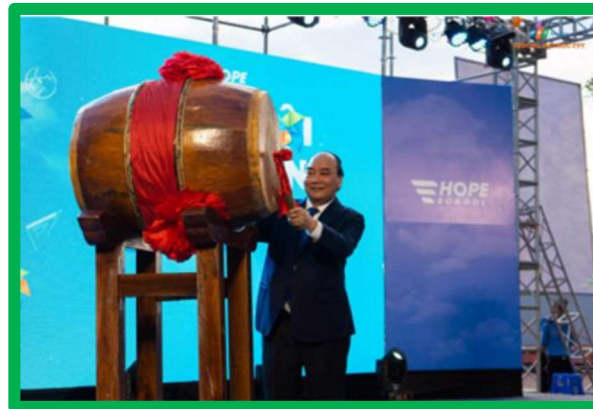
The President of Vietnam beats the drum to open the opening ceremony at Hope School.

Not only helping the Vietnamese community, but several FPT University staff and students have also JOINED CHARITIES AND NGOS TO DONATE MEDICAL SUPPLIES TO OTHER COUNTRIES who are suffering from the pandemic, including Italy, the Czech Republic, the United States, and India. These activities are organized by International Centre for Theoretical Physics (ICTP) graduates (Triest, Italy), The Vietnam – US Alumni Club, along with a few other supportive activities that we have not had the complete list of.