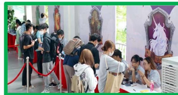
" Brothers and sisters " welcome new students and are ready to support them.

The "BROTHERS AND SISTERS" PROGRAM is an annual activation that supports freshmen as they adjust to their new learning environment at FPT University. Seniors are seen as bridges connecting freshmen with and helping them adapt to the new living and learning environment at FPT University. This is a defining aspect of FPT University's educational environment.