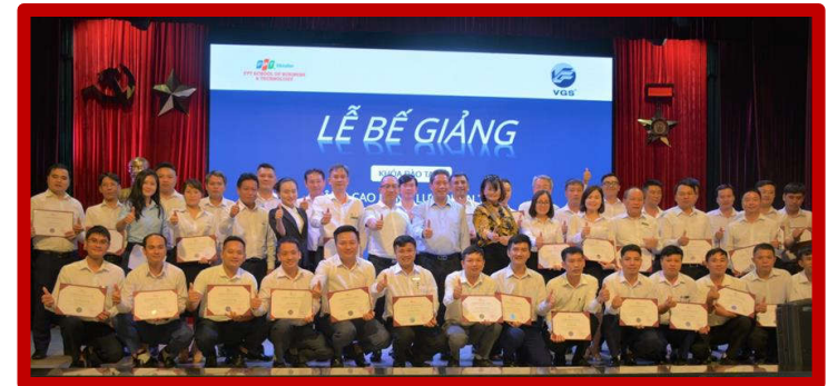
In June 2022, FSB Institute of Management & Technology organized a training course "Improving management capacity" for the management staff of Viet Duc Steel.

In order to reach more classes in the community, at FPT School of Business (FSB), our advanced specialized training school, regularly organize short courses : executive education program for managers present and future