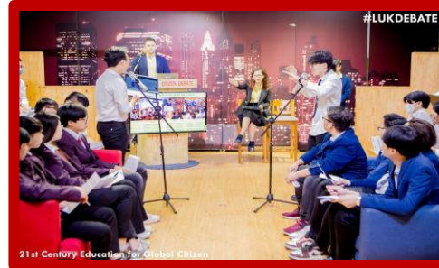
The scene at the English preparation subject for FPT University students. Here, all are designed to create an environment to practice English instead of just in the classroom.

FPT Education Academy International (FAI), a member of FPT Education, we cooperate with international training systems of Aptech, Arena (India) to continuously open short-term courses on Software, Multi Media, etc for people who don't go to university, people who are working, anyone in need in the community.