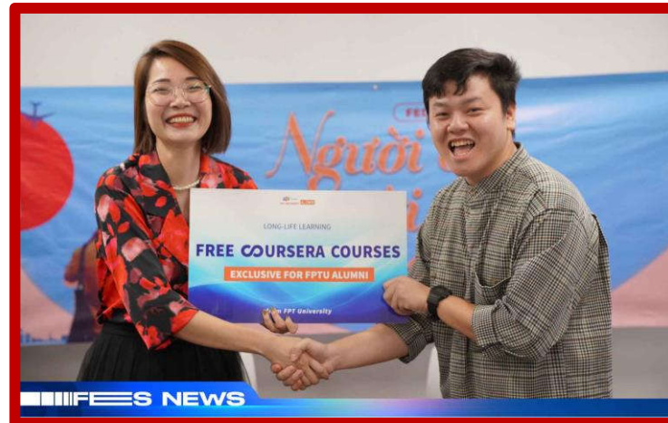
FPTU representative gave FPTU Alumni representative in Japan free coursera accounts

The school has given 1345 free study accounts on Coursera to FPTU alumni, with this gift, alumni can study for free and obtain open learning materials certificates from Stanford University and American universities.