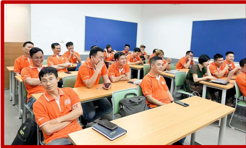
FPT Aptech cooperates with VNPT Group to support staff training in programming