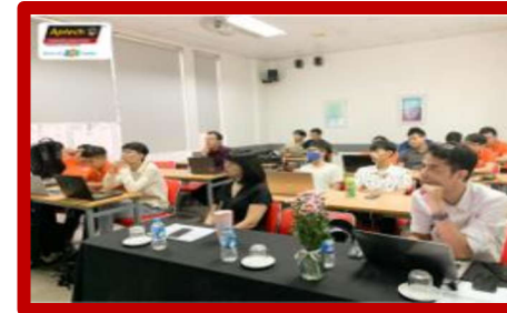
A training class for programmers for non-university students at FPT Education Academy International – FAI

FPT Education Academy International (FAI), a member of FPT Education, we cooperate with international training systems of Aptech, Arena (India) to continuously open short-term courses on Software, Multi Media, etc for people who don't go to university, people who are working, anyone in need in the community.