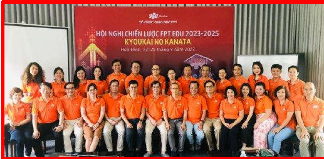
FPTU leadership at the 2023-2025 strategy development meeting, there were 13 female leaders among them.

actions of FPT University students have taken actions under SDG 5 – Gender Equality.