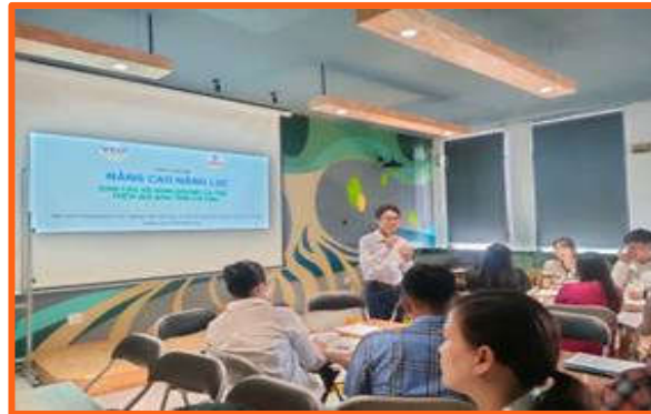
FPTU lecturers in Can Tho participate in entrepreneurship training courses for local communities in the Mekong Delta provinces.