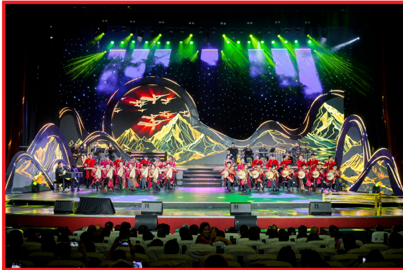
FPTU students performed traditional musical instruments in the project to fundraise for disadvantaged children with congenital heart.