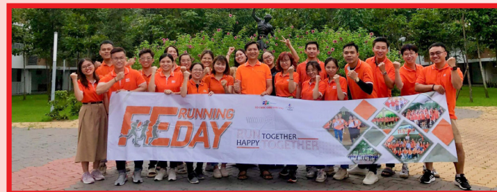
FPTU staffs and lecturers ran more than 1,391 km, which contributing 14,000,000 VND to the Hope Fund to support orphans.