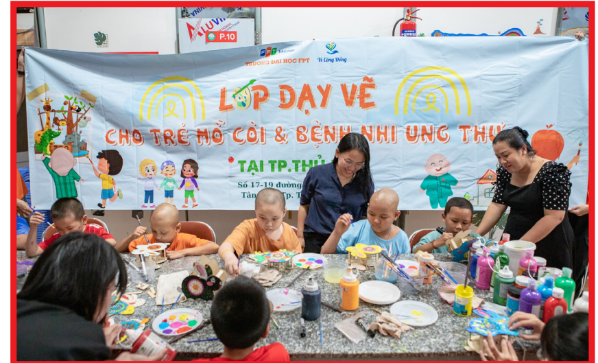
These free classes are held every Sunday by FPTU’s lecturers and students.