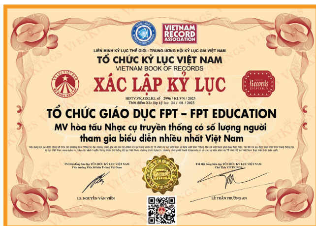
MV “Thien Am” set a Vietnam Record on October 18th

1,350 FPTU students and lecturers of FPTU performed 7 traditional musical instruments in the MV “Thien Am” which set a record of the most crowded traditional musical instrument MV in Vietnam. After being released on social media channels for three weeks, the MV has gained more than 285,000 followers.