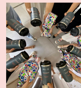
Gifts for female employees on October 20th and March 8th every year from the FPTU Labor Union