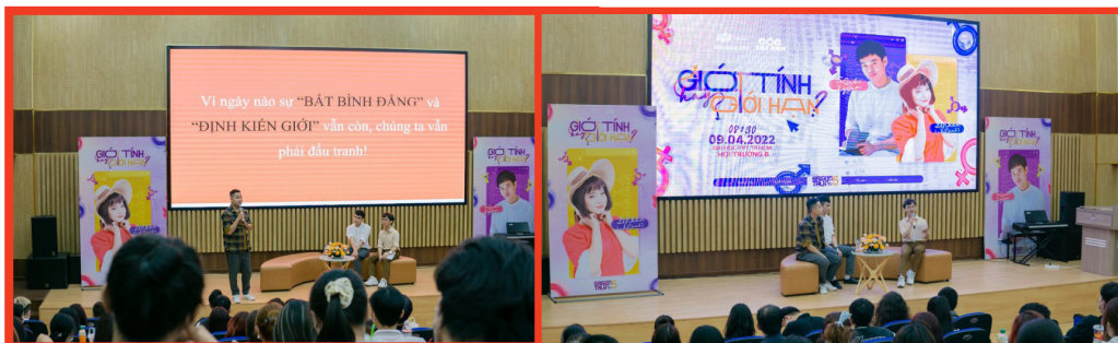
Saigon Talk episode 5 titled “Gender or Limit?” was organized by FPTU

With the aim of bringing positive values and messages to young people, “Saigon Talk” is a regular talk show organized by FPTU clubs and students for young people to learn life experiences and lessons from stories of successful people in various fields, as well as about significant social issues. In there, you can find solutions for your personal problems.