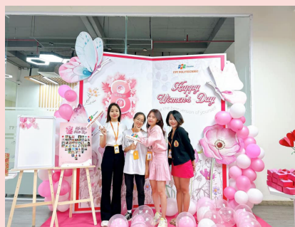
“Happy International Women’s Day” annual programs are organized on March 8th