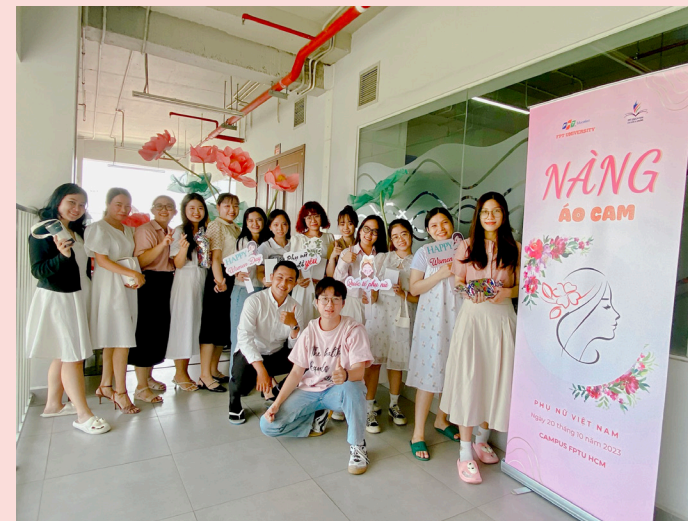
“Happy Vietnamese Women’s Day” annual programs are organized on October 20th