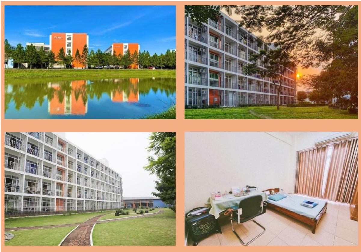
FPT University Hanoi Dormitory for employees