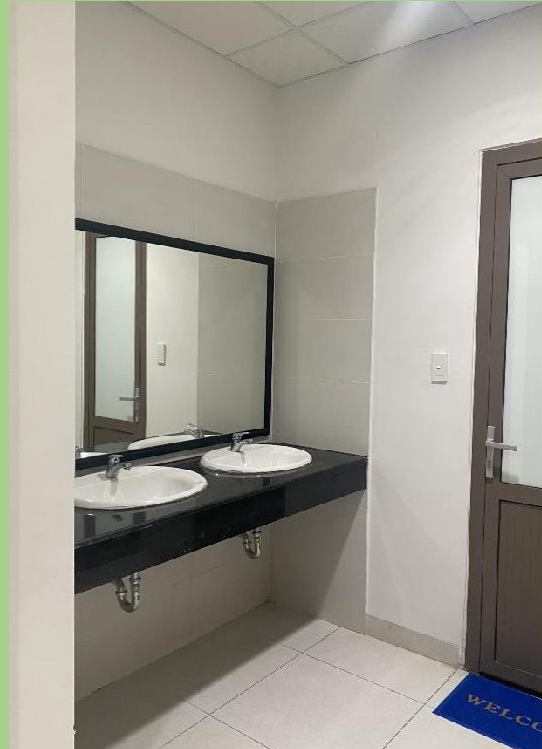
FPT University Danang Dormitory for employees